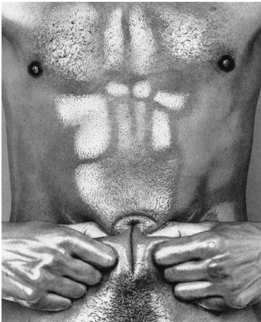
Pierre Radisic, Lucky , Cliché, 5

The first is the most obvious. Let us intensify the negative under the electronic 1500 joules flash slightly above and from the side, so that any pore or hair of a skin stands erect or ploughs like ground accidents. When we reach our destination, let us impose an 'excessive' development to the print, 46 X 56 cm, which will magnify the geology of the surfaces through the grain. However, the orchestration is still timid, and one finally resorts to the good old graphic touch up, using a paintbrush and ink. Whereas the latter had previously compensated what was too abrupt in photos, it now reinforces the local extravagances, leading them to granular intensities in between which resonances of aberrances develop. In a word, it boosts up the photographical.