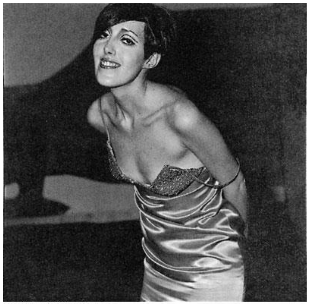
Diane Arbus, Girl in a shiny dress