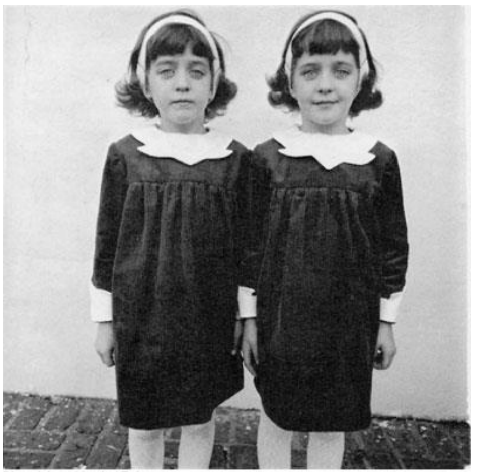
Diane Arbus, Identical Twins

Arbus's protocols follow her perception. The flash plays a predominant role, because it congeals the cell to the profit of juxtaposing and ossifying repetitions. The night is better than the day because it cuts the cells, because the flash is stronger, because, in the most ordinary way, it is the moment where everything that is 'odd' emerges in a society and in things, perhaps because the Semitic day goes from night to night. Arbus was greatly inspired by Weegee, nocturnal New-York detective photographer.