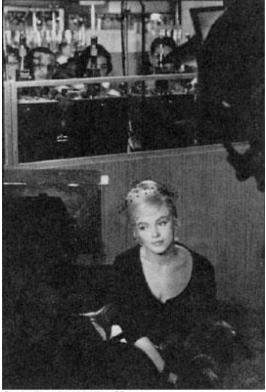
Cartier-Bresson, Marilyn, CP, 175

Through the photographs, this topology finds its lightning speed in the zigzag plunge of a sheet and a magazine (CP, 144), in the zigzag of a family in the opposite page (CP, 145), in the zigzag of palisades seen from above (CP, 143). It supports the resting figures of CPJ52 and 153, and Marilyn (**, CP, 75) interviewed under the domineering instances of the cinema. Assuredly, we find the variants, for instance left-right (C, 141) instead of right-left (CP, 140); or still, a vertical déboulé (CP, 149, 148). But for the essence, the party of existence is constant.