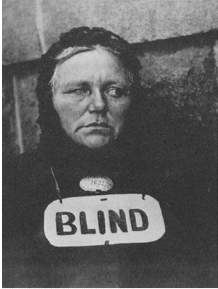
Paul Strand, Aveugle, PF, 49 ; FS, n°195